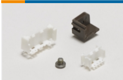
PCB Connector Mounting(10)