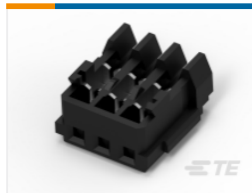
TE Part # 2-353293-3 1.5MM CT MT REC ASS'Y 3P BLACK