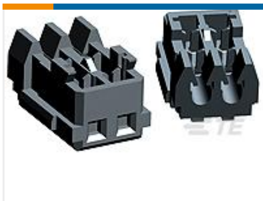
TE Part # 5-353293-3 MINI CT MT REC ASSY 3P BLUE