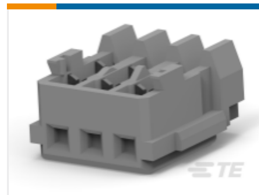
TE Part # 353293-3 MINI CT MT REC ASSY 3P GRAY